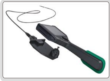
changeable lens cable